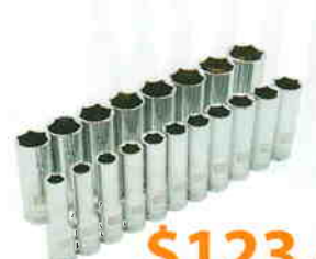
D018005 $123.99 19 Pc 6 Pt Deep Metric Socket Set • 10-28 mm List Price: $187.98