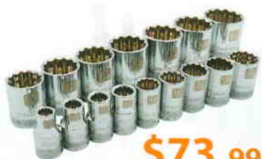
D018002 $73.99 16 Pc 12 Pt Standard SAE Socket Set • 3/8"-1 5/16" List Price: $111.12