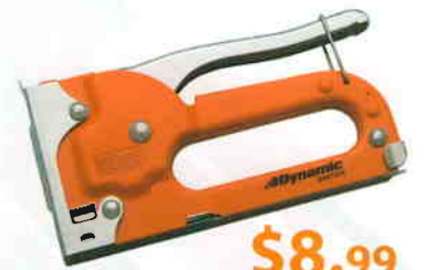
D087000 Staple Gun Tacker List Price: $13.46