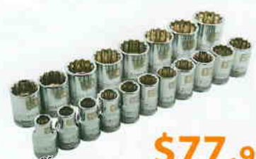
D018006 $77.99 19 Pc 12 Pt Standard Metric Socket Set • 10-28 mm List Price: $117.65