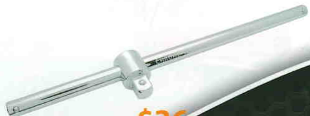
D019501 Sliding T Bar List Price: $55.13