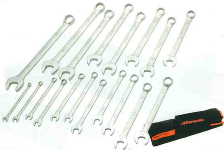
D074223 19 Pc Metric Combination Wrench Set Contractor Series • 6-24 mm List Price: $137.82 $90.99