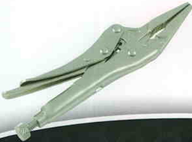
Locking Plier Long Nose