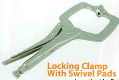
Locking Clamp With Swivel Pads