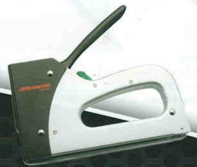
D087001 Staple And Nail Gun List Price: $30.40