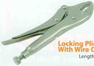
Locking Plier Curved Jaw With Wire Cutter