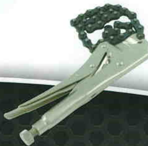
Locking Chain Clamp