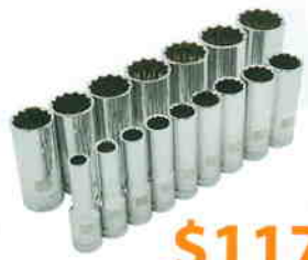
D018003 $117.99 16 Pc 12 Pt Deep SAE Socket Set • 3/8"-1 5/16" List Price: $179.51