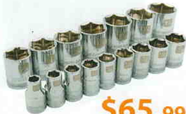
D018000 $65.99 16 Pc 6 Pt Standard SAE Socket Set • 3/8"-1 5/16" List Price: $99.98