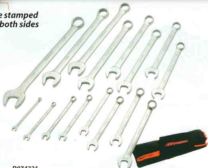
D074221 16 Pc SAE Combination Wrench Set Contractor Series • 1/4" - 1 1/4" List Price: $136.80 $89.99