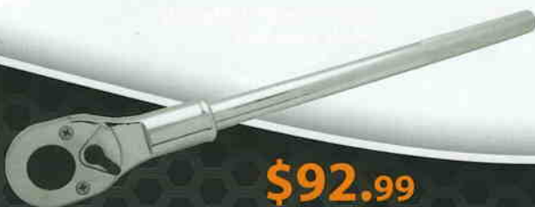
D019301 Ratchet Chrome List Price: $141.30