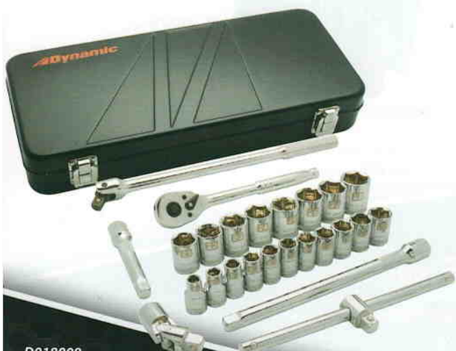
D018009 $168.99 25 Pc 6 Pt Standard Metric Socket Set • Metric Std: 10-28 mm • 5", 10" Extensions • Flex Handle, T-Handle • U-Joint, 45 Tooth Ratchet List Price: $256.59