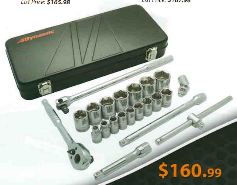
D018008 $160.99 22 Pc 6 Pt Standard SAE Socket Set • SAE Std: 3/8"-1 5/16" • 5", 10" Extensions • Flex Handle, T-Handle • U-Joint, 45 Tooth Ratchet List Price: $244.64