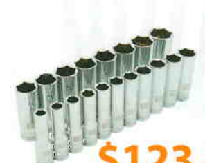
D018005 $123.99 19 Pc 6 Pt Deep Metric Socket Set • 10-28 mm List Price: $187.98