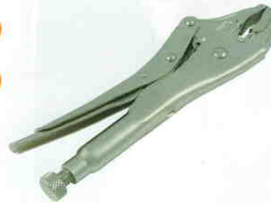
Locking Plier Curved Jaw