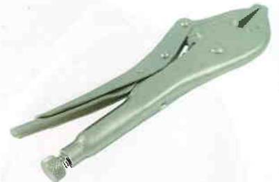
Locking Plier Straight Jaw