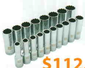
D018007 $112.99 18 Pc 12 Pt Deep Metric Socket Set • 10-27 mm List Price: $171.77