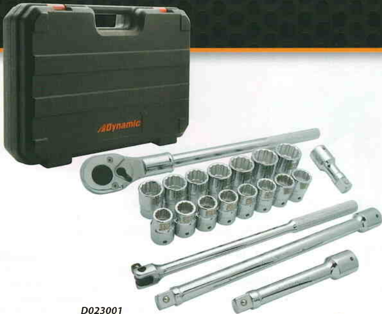
D023001 20 Pc 12 Pt Std Metric Set • Metric Std: 19-36 mm • 4", 8", 16" Extensions • Flex Handle, 24 Tooth Ratchet List Price: $491.18