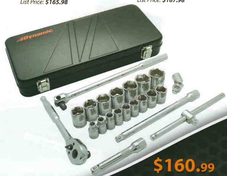
D018008 $160.99 22 Pc 6 Pt Standard SAE Socket Set • SAE Std: 3/8"-1 5/16" • 5", 10" Extensions • Flex Handle, T-Handle • U-Joint, 45 Tooth Ratchet List Price: $244.64