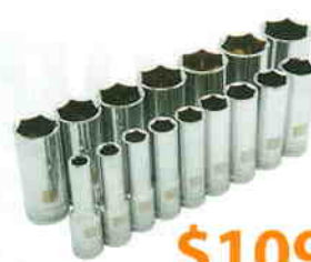
D018001 $109.99 16 Pc 6 Pt Deep SAE Socket Set • 3/8"-1 5/16" List Price: $165.98