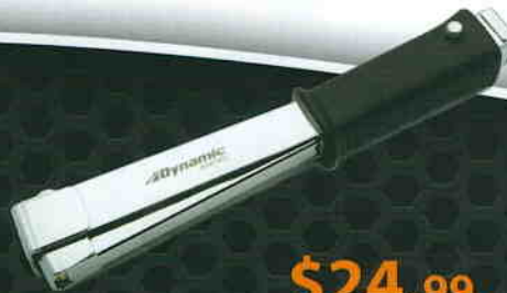
D087003 Hammer Tacker List Price: $37.61