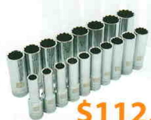
D018007 $112.99 18 Pc 12 Pt Deep Metric Socket Set • 10-27 mm List Price: $171.77