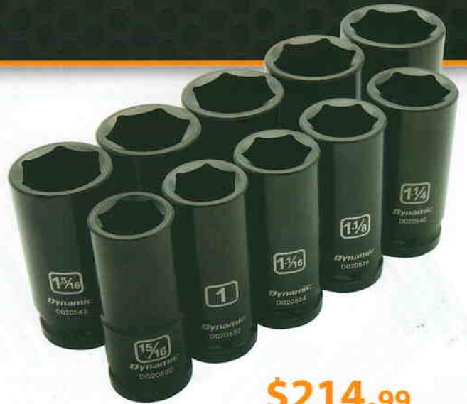
D021001 10 Pc 6 Pt Deep Impact SAE Set • 15/16"-1 5/8" List Price: $326.19