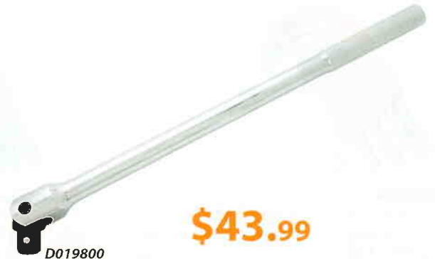
D019800 Flex Handle List Price: $66.87