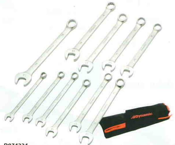
D074224 11 Pc Metric Combination Wrench Set Contractor Series • 9-19 mm List Price: $60.76 $39.99