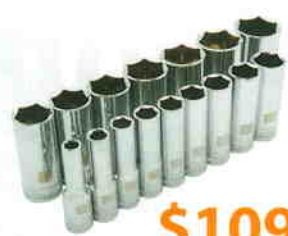
D018001 $109.99 16 Pc 6 Pt Deep SAE Socket Set • 3/8"-1 5/16" List Price: $165.98