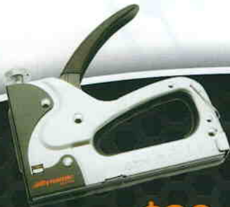
D087002 4-in-1 Staple Gun Tacker List Price: $45.00