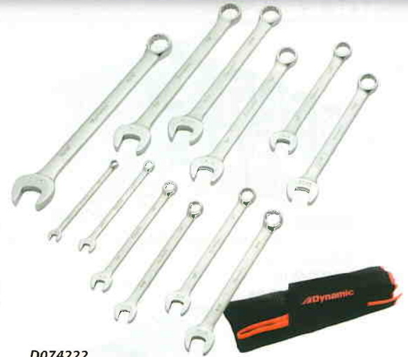
D074222 12 Pc SAE Combination Wrench Set Contractor Series • 1/4" - 1 5/16" List Price: $75.40 $49.99