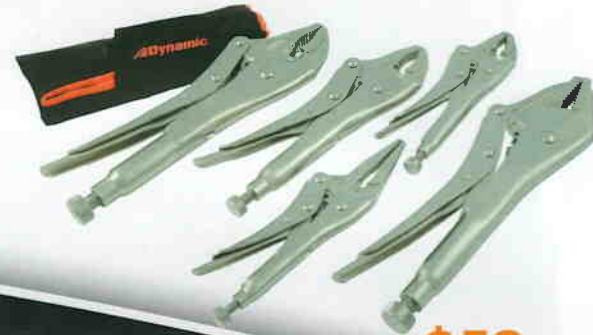
D055316 5 Pc Locking Tool Set