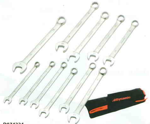
D074224 11 Pc Metric Combination Wrench Set Contractor Series • 9-19 mm List Price: $60.76 $39.99