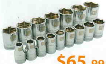
D018000 $65.99 16 Pc 6 Pt Standard SAE Socket Set • 3/8"-1 5/16" List Price: $99.98